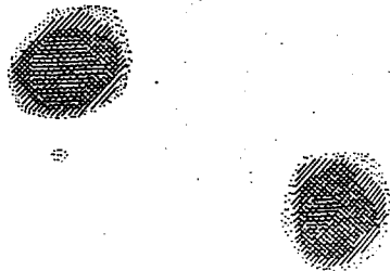
Fig. 2 Proton nuclear magnetic resonance zeugmatogram of the object described in the text, using four relative orientations of object and gradients as diagrammed in Fig. 1.